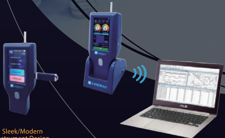
Sleek/Modern Instrument Design