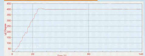
Heating curve determination:

Heater fail notification: When the heater failed, "H-E" will Be shown, SIA will power off