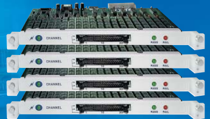
It can extend to 80Ch

RJ45 connector tester measurement: L , Q , Leakage L , ACR , Cp , DCR , Pin Short , Balance, Turn Ratio , Phase , Turn